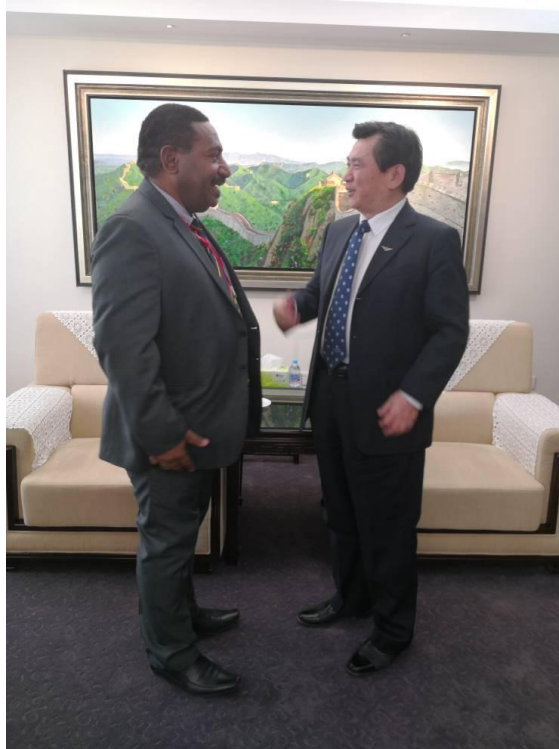
PNG Minister for Civil Aviation Hon. Alfred Manase meets with Vice Minister (Ministerial Level) Feng Zhenglin Administrator of Civil Aviation Administration of China